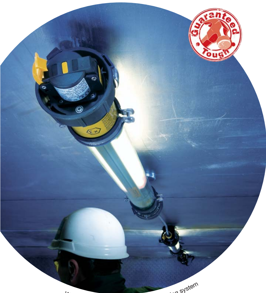
Worklights shown with magnetic mounting system

The Slam Hornet Ex Worklight has moved hazardous area portable lighting technology into a new era. First and foremost, it has been developed, built and certified as a truly portable worklight. This means that it has passed rigorous testing including severe drop and impact tests. Using twin 36W compact fluorescent lamps, it is also extremely reliable, requires virtually no maintenance and has a high light output. For the many professionals who already use this system, it has transformed their working environment.